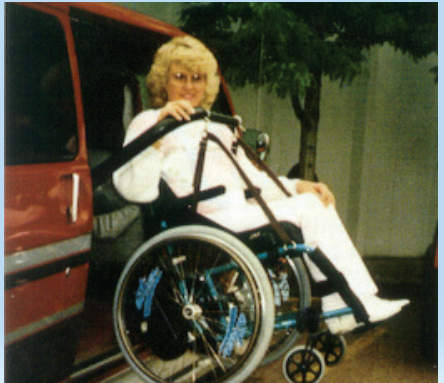
Handicaps, Inc 4335 S. Santa Fe Drive Englewood, CO 80110

*NHTSA's National Center for Statistics and Analysis Sept. 1997 report